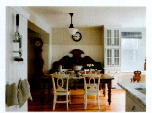
PINE ANTIQUES include an English table, country Swedish clock, and French butcherblock sideboard with a curving backboard. The furniture's wood tones stand out against the white beadboard paneling, which was inspired by paneling that existed in another area of the Victorian house. Mounted on the wall (foreground) is a wine bottle opener that the homeowner bought in a Paris department store.

For all our store locations visit walpolewoodworkers.com