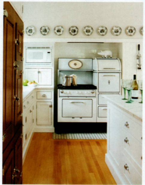
VINTAGE APPLIANCES give the kitchen an authentic period look. The stove (ABOVE) has been restored to working order and is used daily. It rests on a tumbled marble mosaic inlay in the beech plank floor. The only dark wood cabinetry in the kitchen is the icebox-style cherry front, designed by Zoya Soane, that covers a new refrigerator. A vintage icebox (LEFT) was restored for use as a storage piece and media center; its mirrored inset is original.

windows be duplicated from it. They also copied the back hall's simple beadboard paneling and installed it along the kitchen walls and on the island base. The original cabinets and the hardware in the butler's pantry became the prototypes for the new custom-made kitchen cabinets. For the countertops, Soane chose period-appropriate marble, making her selection by matching a slab of white marble that she discovered in the recesses of the cellar. And although they considered installing a period-appropriate black-and-white tile floor, in the end they chose beech planks finished to match the colors of the floors in the rest of the house.